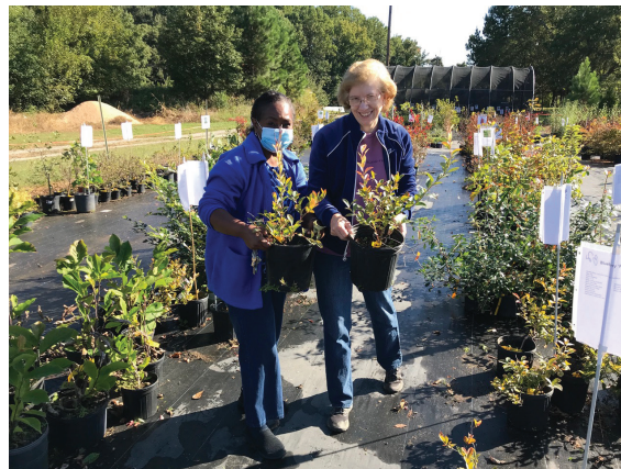
With Covid winding down, more people turned out to purchase plants in 2022.