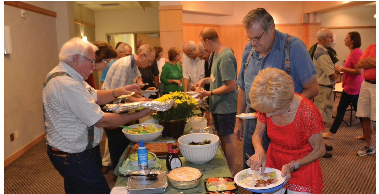
The fall picnic, usually a pot luck dinner in September, always brings out a large number of the membership for amazing home-cooked dishes.