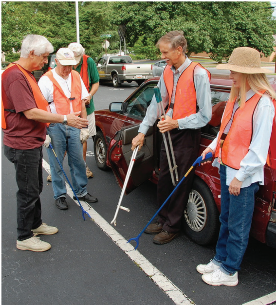
Volunteers for the Club prepare to tackle a two mile section of Pine Street in Spartanburg to help keep the city "green and clean".

In 2009, the Spartanburg Men's Garden Club moved to its present location in the Horticultural Gardens of Spartanburg Community College. The Club is grateful for the support of the staff and faculty and has established a book fund for horticultural students at SCC.