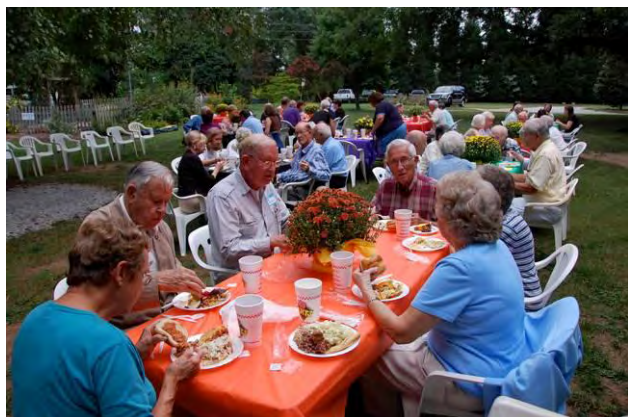
Members enjoy food and fellowship at a previous picnic.

2010 dues collection will begin at Monday's picnic. According to new guidelines, dues will be solicited during September, October, November and December. The new membership list will then be printed in the January 2010 newsletter. To be included, please pay your dues promptly. You can do so by mailing a check for $20 (single); $28 (family); $100 Corporate, to SMGC Treasurer, P.O. Box 1502, Spartanburg, SC 29304 right now. You can also go to our web site: www.dirtdaubers.org and click on the Membership tab. Click on Membership Application to download our new form. Or, simply bring your checkbook to the picnic.