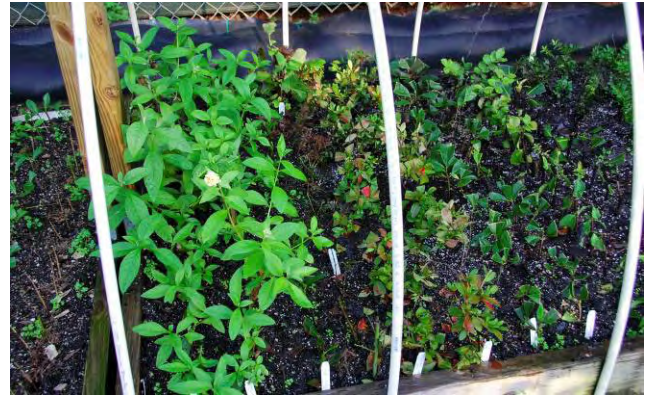
The plants that were "stuck" in June, July and August have rooted and are flourishing. In late October or early November, camellia and sasanqua cuttings will be made. Next spring we should have about 1,600 new plants ready for potting up.