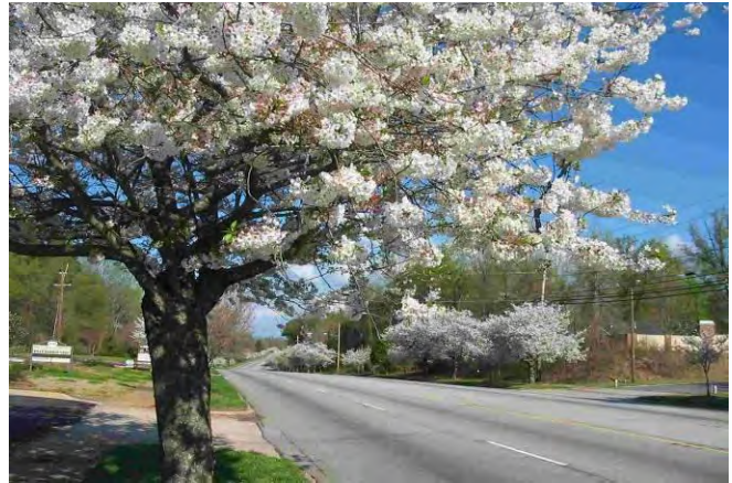
Cherry trees planted by club in full bloom.

There's a picture at upper right of some of the Yoshino Cherries in full bloom, and they're a wonder to behold when they're like that, but many suffered from last winter's ice storm, as well, and need to be replaced. I don't think an extra $25 will break most of us, and I plan to contribute that towards this fund to help replace the dead and dying trees on South Pine Street. I hope everyone else will throw in seven cents a day and join me... Jeff Hayes.