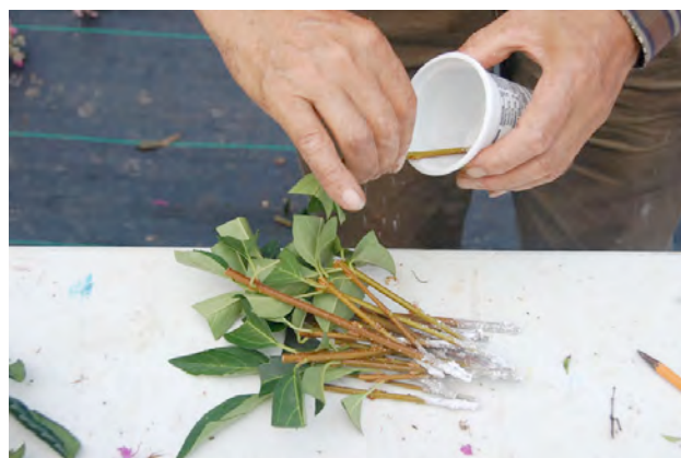
John Woodward prepares cuttings to be "stuck" in the new propagation beds. The cuttings are trimmed to 5-7 inches, the lower leaves are removed and the remaining leaves cut in half to reduce metabolic requirements and encourage root growth.