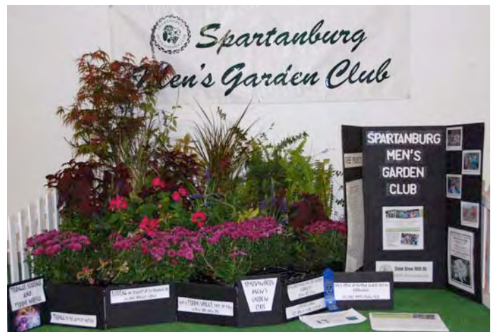
Above: The SMGC exhibit at the Piedmont Interstate Fair in October. Note the blue ribbon!