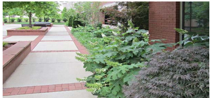
2012 First Place, Public Service (Small): George Dean Johnson School of Business.