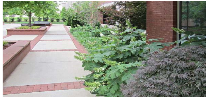
2012 First Place, Public Service (Small): George Dean Johnson School of Business.