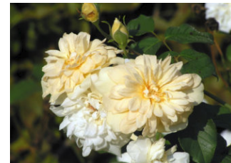
'Alister Stella Gray', a noisette rose