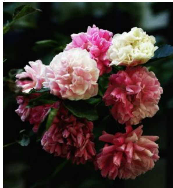
'Dorothy Perkins', a rambling rose