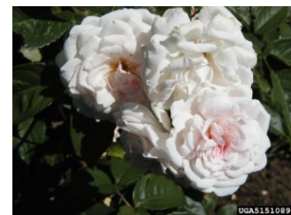
'Marie Pavie', a polyantha rose.