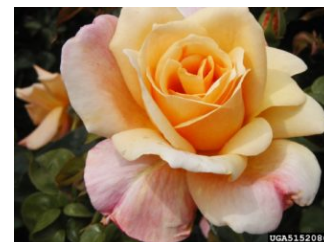
'Sutter's Gold' hybrid tea rose. The Dow Gardens Archive, Dow Gardens, www.insectimages.org