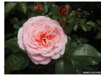
'Sexy Remy', a disease resistant floribunda rose

Old Roses: Old roses include all rose groups developed before the introduction of the first hybrid tea rose. These