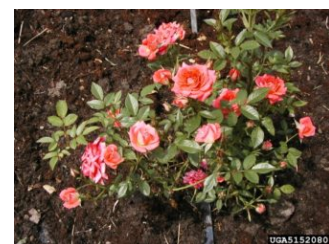
'Starina', a miniature rose.