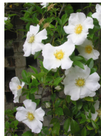
Cherokee rose ( Rosa )