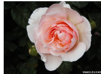
‘Heritage’, an English rose.