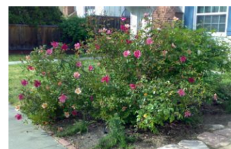
‘Mutabilis’ China rose flowers age from apricot to deep pink.