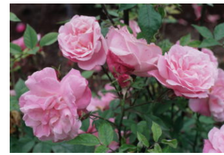
'Old Blush', a China rose.

Tea Roses: Tea roses have exquisite, soft-colored blooms