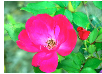
‘Knockout’, a popular modern shrub rose.

Centifolias: Centifolias are the ‘Cabbage Roses’. They are thorny, open bushes to 4 to 5 feet high. The very large, double and fragrant blossoms are borne so freely that they cause the plant’s branches to nod under their weight. Colors range from white to deep rose-red, sometimes striped and