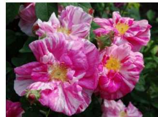
‘Rosa Mundi’, a gallica rose.