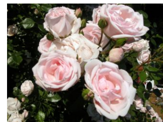
'New Dawn', a large flowered climbing rose.

Miniature Roses: Miniatures range in height from 8 to 24