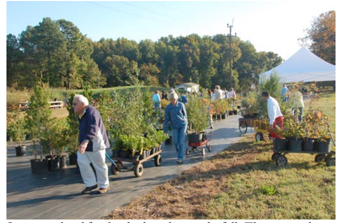
Customers head for the checkout line in the fall. This spring there will be a lot of new plants to consider.