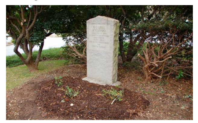
The W. O. Ezell Monument garden spot was pruned hard and the Knockout roses were removed in October. Three small roses ('Borderer') from the Antique Rose Emporium were planted in their place. The new roses should not grow over 24 inches tall. The rest of the trees and shrubs will be pruned more over the winter to get them in good shape for the spring.

Charles Covert has been monitoring the two garden spots for which the Club has responsibility. The Claude Sherrill Garden Spot at Hillcrest is still looking good with the Knockout roses and the summer plants. Pansies will be added shortly to go through the winter. The W. O. Ezell monument was cleared by Charles and Linda McHam in September and then again by Linda McHam and Alan Lemieux. The tress and shrubs were cut back severely. The two large Knock Out roses which were hiding the monument were removed and planted near the propagation area at SCC. Linda purchased three small roses that she and Alan planted at the foot of the monument. They should not grow over 24 inches tall. Hopefully they will survive the current drought and make it through the winter.