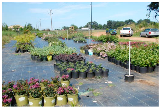
The container nursery in August. The color and health of the plants is outstanding but the weeds are really healthy, too. Be sure to lend a hand in getting the plants ready for the sale!

Tim Hemphill is asking for help on Saturdays between now and then to make the pots and nursery look as good as possible for our customers. Many hands make light work!