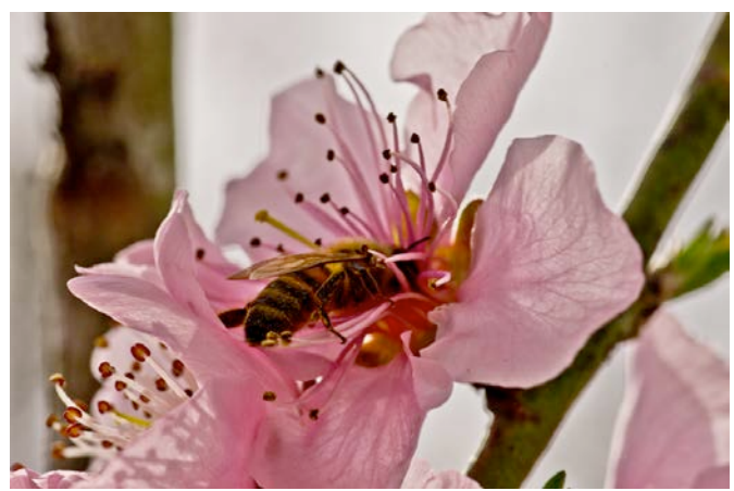
Honeybee on a dwarf peach blossom. Photo by Jeff Hayes, 2012.

Two Dogwoods trees were given to the Spartanburg Garden Club Council for the East Piedmont District Spring 2012 Meeting.