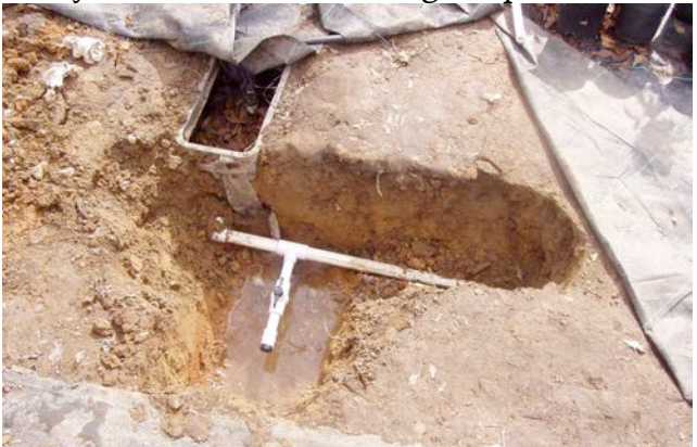
Detail of the automatic drain valve recently installed at the nursery.

Don Crowder, Lou Adams and Ben Waddell have revised some of the irrigation to make it easier to drain the system. They installed automatic drains and a shut off valve near the shed. This will allow us to keep watering longer through the winter without having to worry as much about freezing temperatures.