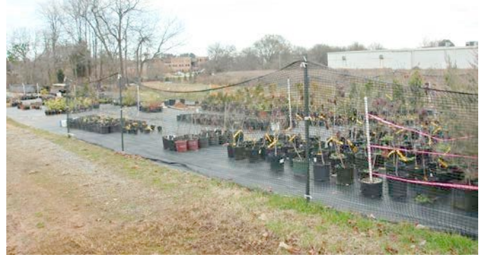
The windbreak helps keep plants from blowing over.

Charlie Crescenzi has done a great job of organizing volunteers to help in our Container Program. In addition to potting sessions, members have been assigned a slot to monitor the water system two times a month each. This includes making certain that all the plants are getting water because dry plants don't survive cold as well as ones that have enough moisture. The volunteers also check to make sure that plants have not been blown over. A "plant corral" was made from plastic fencing found in the dirt piles near the shed. This seems to have kept most of the plants upright except from the strongest wind. The following people have made time to check on the plants and we greatly appreciate their help! They are: Lou Adams, Chuck Covert, Charlie Crescenzi, Don Crowder, Frank Falk, Tim Hemphill, Linda McHam, Gail McCullough, Lyn Pesterfield, Peggy Romine, Prafull Gajendragadkar and Jim Weeks.