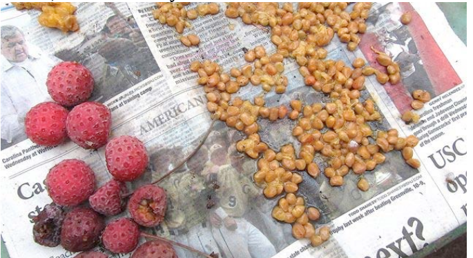
Above, on the left are the round fruit of the Cornus kousa dogwood. On the right are the cleaned seeds. Photo by Henry Pittman, 2012.

8. Ideally, keep on a bench and in a greenhouse. Some of this may be overkill, but I get nearly 100% success with dogwood and magnolia with this process (except I don't eat the "fruit" of magnolia, and you don't have to eat the kousa fruit either, but it is tasty.